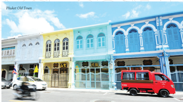
Phuket Old Town