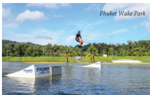
Phuket Wake Park