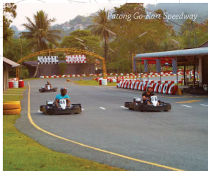
Patong Go-Kart Speedway