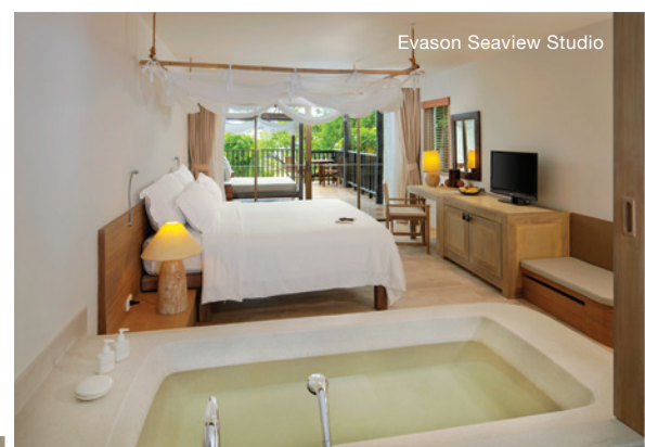
Evason Seaview Studio