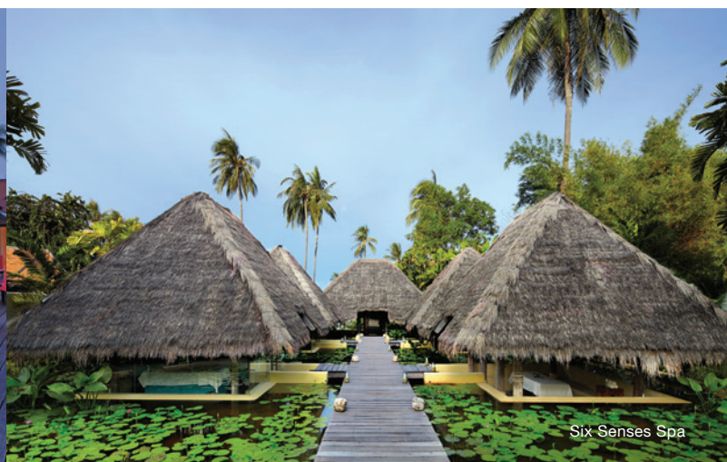
Six Senses Spa