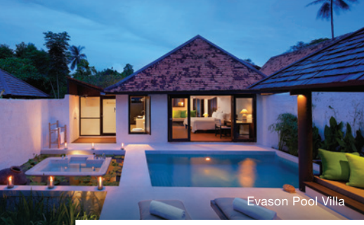
Evason Pool Villa